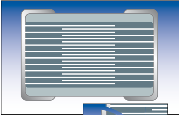
Open Mode capacitor -

Qualification included cracking the components by severe bend tests. Following the bend tests cracked components were subjected to endurance / humidity tests, with no failures evident due to short circuits. Note: Depending on the severity of the crack, capacitance loss was between 0% and 70%.