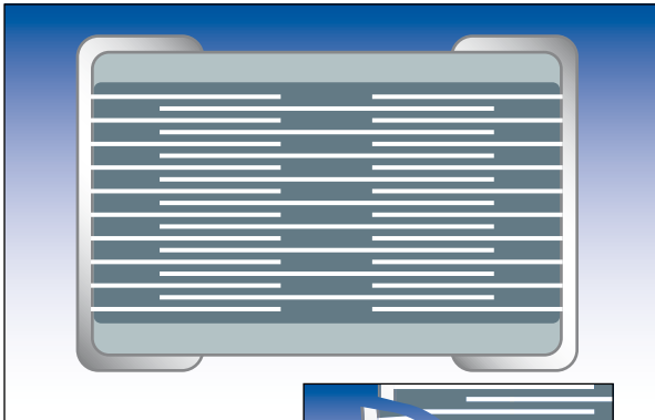
Tandem capacitor -

Qualification included cracking the components by severe bend tests. Following the bend tests cracked components were subjected to endurance / humidity tests, with no failures evident due to short circuits. Note: Depending on the severity of the crack, capacitance loss was between 0% and 70%.