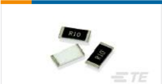
TE Part #6-1622825-9 RL73K 2B R22 5% 5K RL