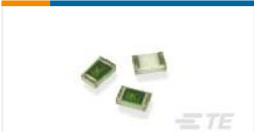
TE Part #3-2176091-6 RP 2A 0.25W 133R 0.1% 25PPM 1K RL