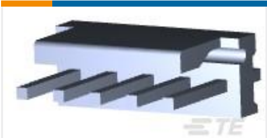
TE Part #3-641208-5 05P MTA156 HDR ASSY FL ST LF