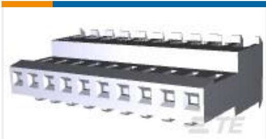
TE Part #4-640621-0 10P MTA100 CONN ASSY F/T NATL